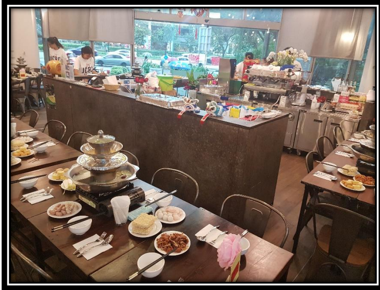
Set Up at Main Dining Area Steamboat Menu