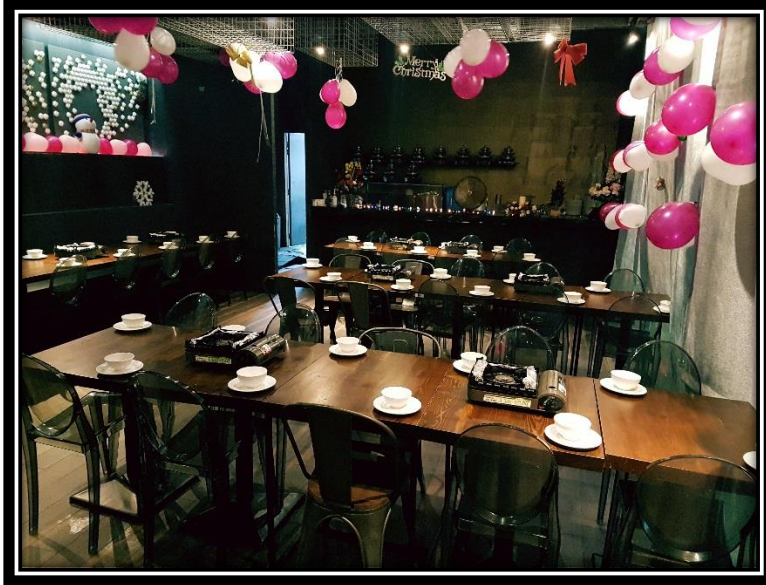
Birthday Celebration Set Up Steamboat Menu